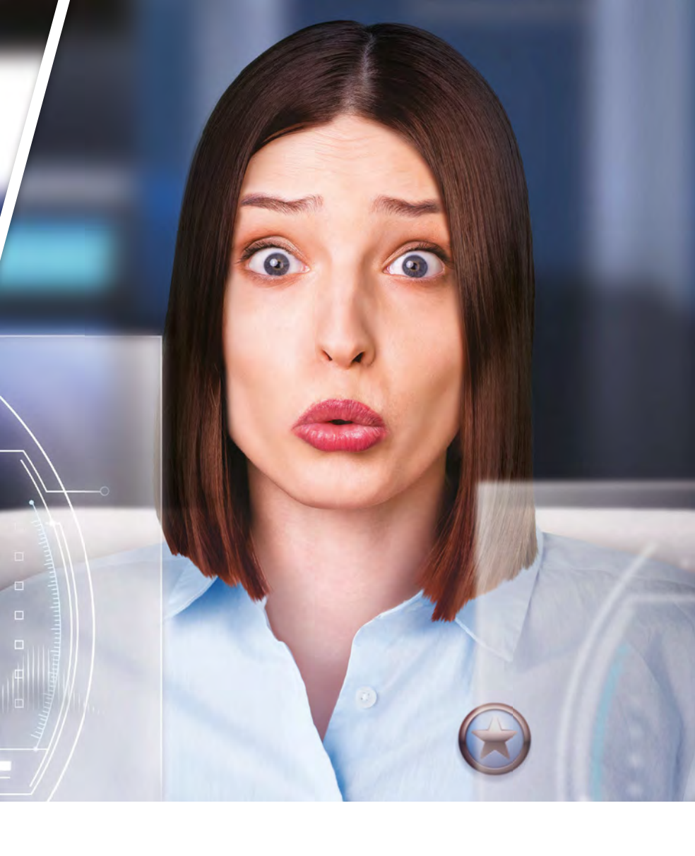
"It's getting closer . . ."