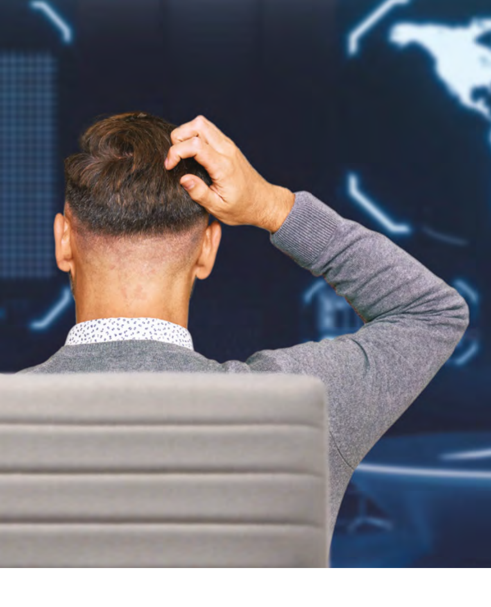
"Play it again," Major Holt said. "This could be a joke. Maybe it's a crewman's naughty trick."