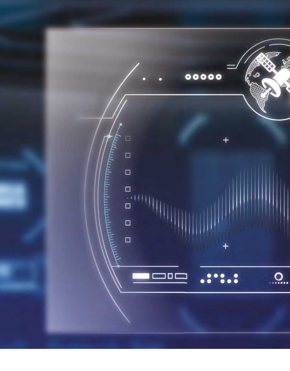
Beep! A second clip came in. The voice was even more distraught.