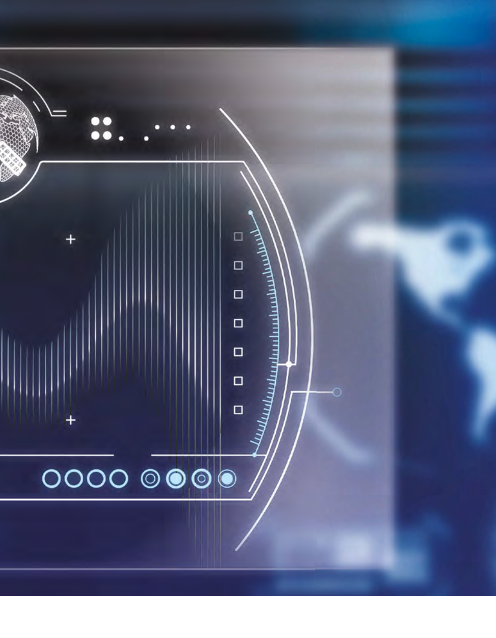
"Can't resist . . ." There was a muffled shout at the end.