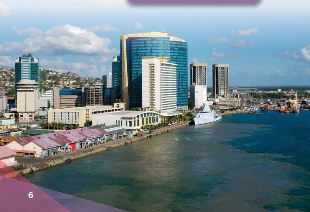
Port of Spain, Trinidad and Tobago