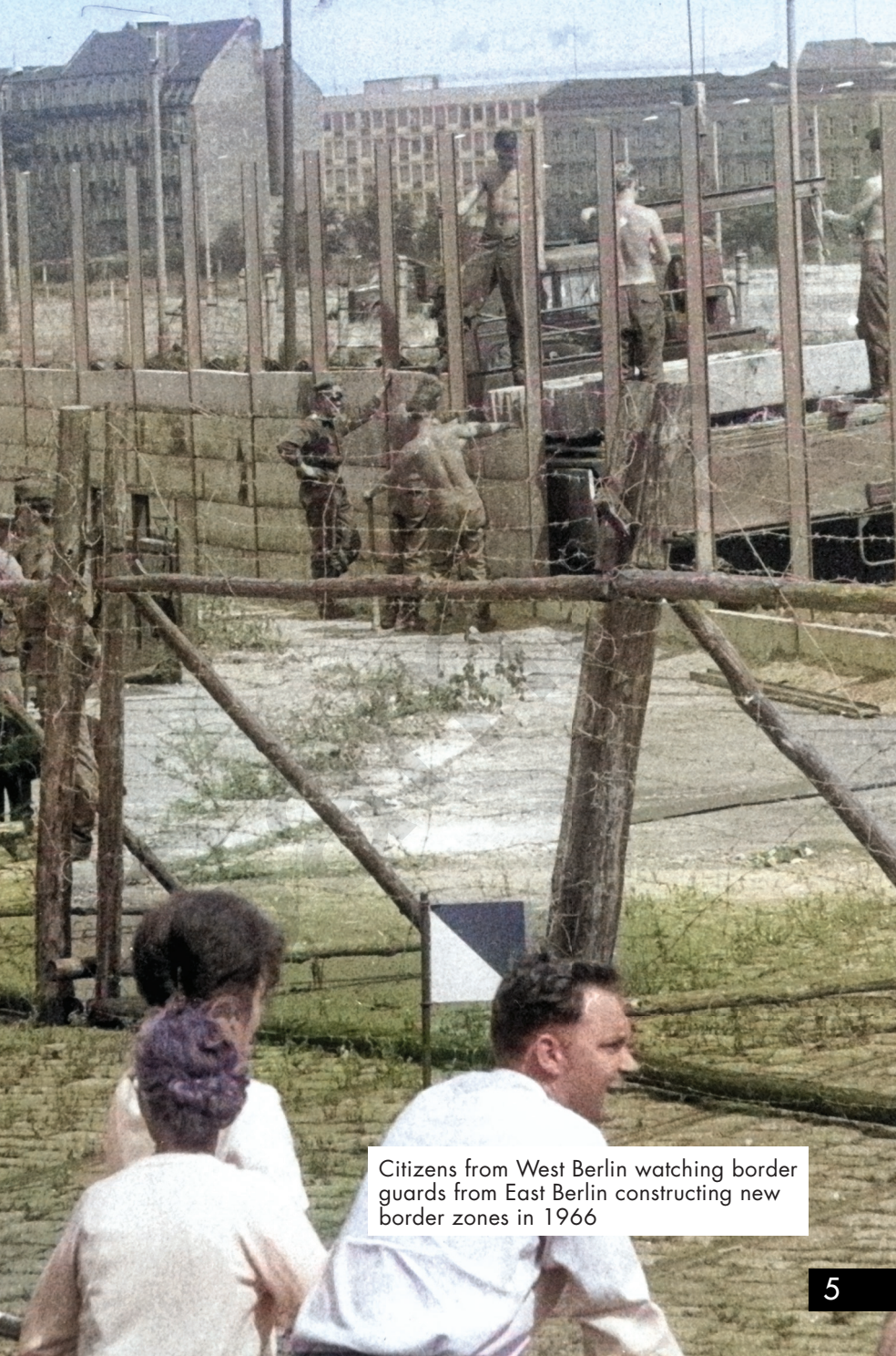
Citizens from West Berlin watching border guards from East Berlin constructing new border zones in 1966