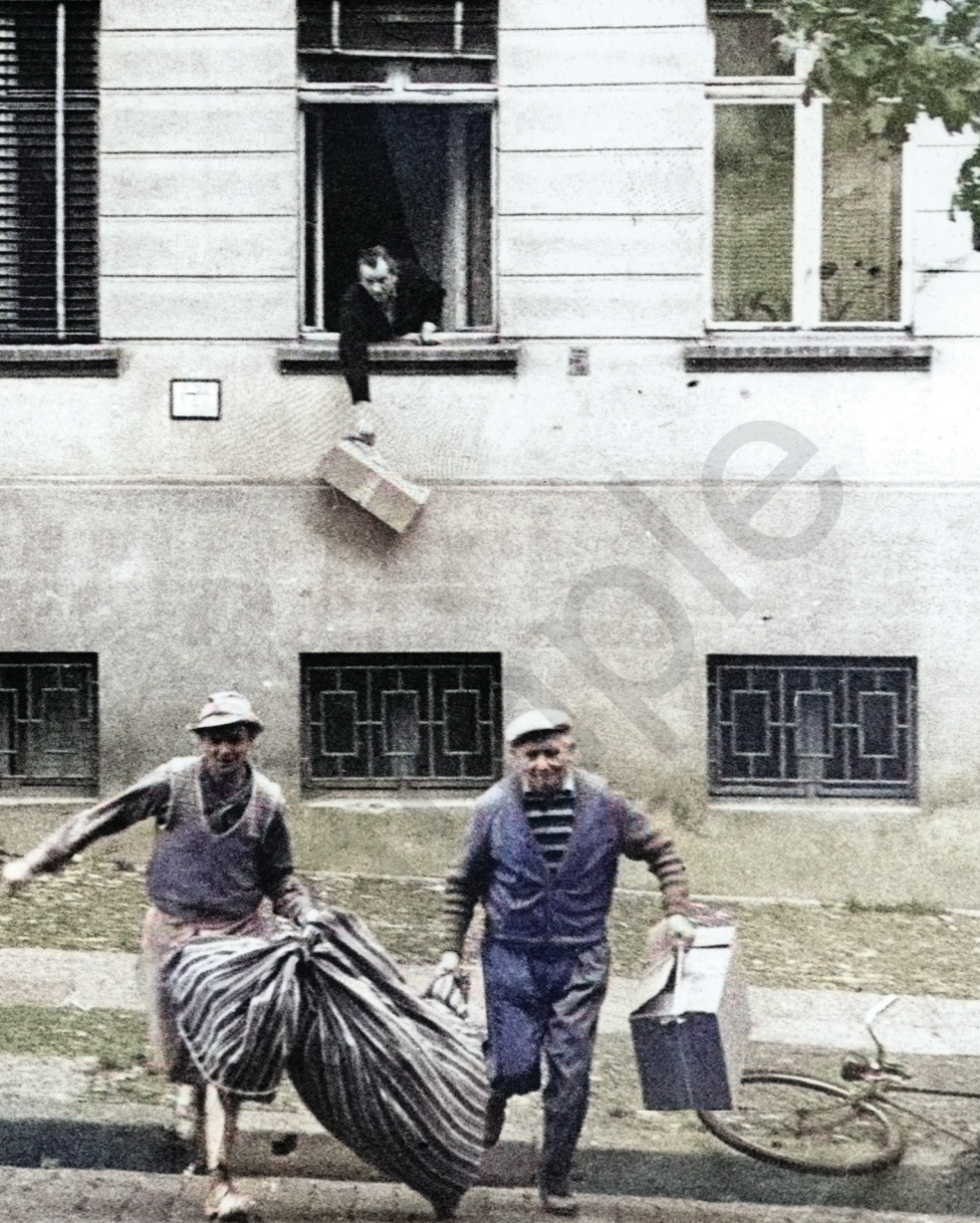
Citizens from East Berlin fleeing to West Berlin, 1961